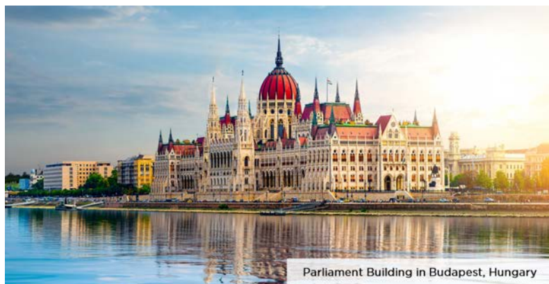
Parliament Building in Budapest, Hungary