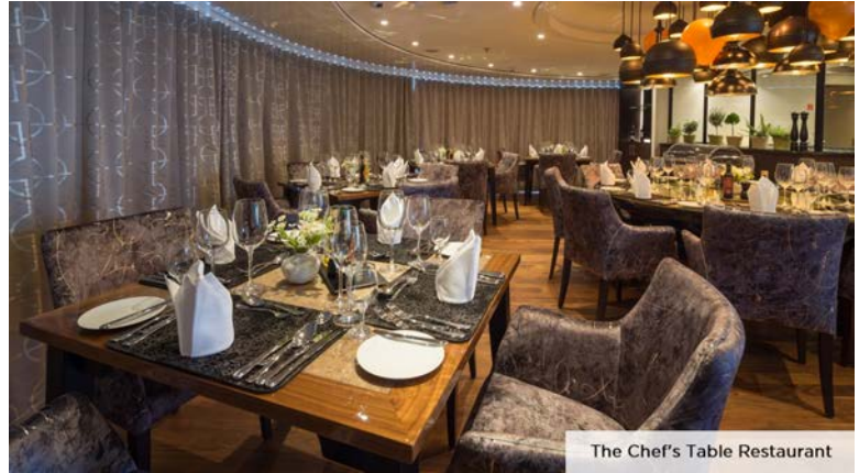
The Chef's Table Restaurant